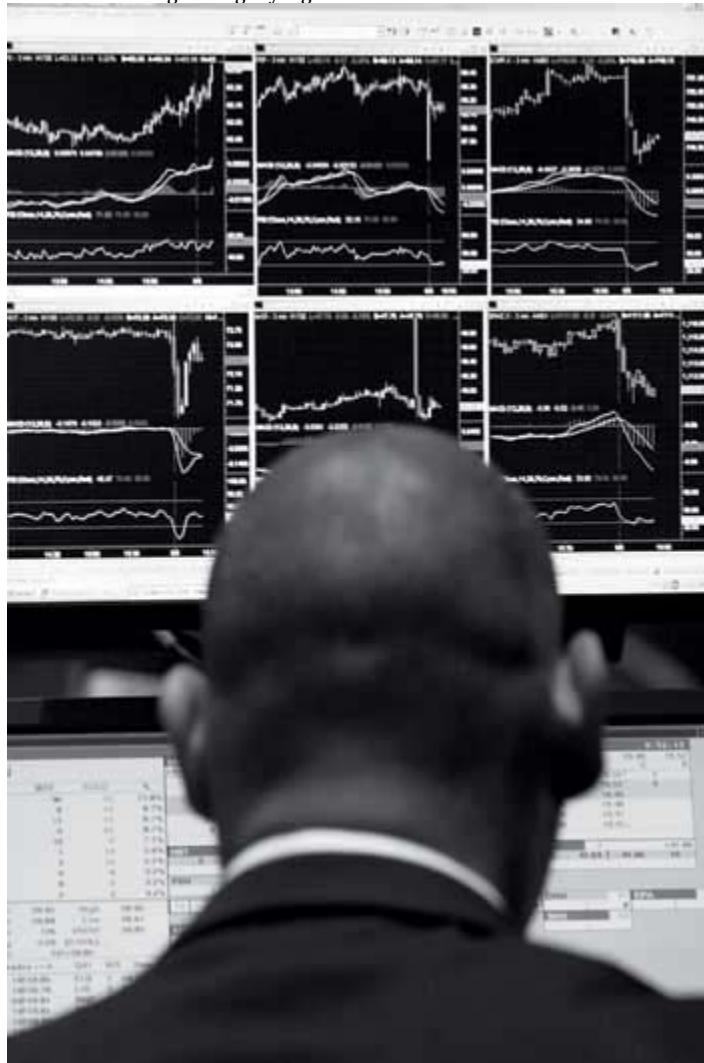
"...correlation is charlatanism"

Yet during the '90s, as global markets expanded, there were trillions of new dollars waiting to be put to use lending to borrowers around the world—not just mortgage seekers but also corporations and car buyers and anybody running a balance on their credit card—if only investors could put a number on the correlations between them. The problem is excruciatingly hard, especially when you're talking about thousands of moving parts. Whoever solved it would earn the eternal gratitude of Wall Street and quite possibly the attention of the Nobel committee as well. To understand the mathematics of correlation better, consider something simple, like a kid in an elementary school: Let's call her Alice. The probability that her parents will get divorced this year is